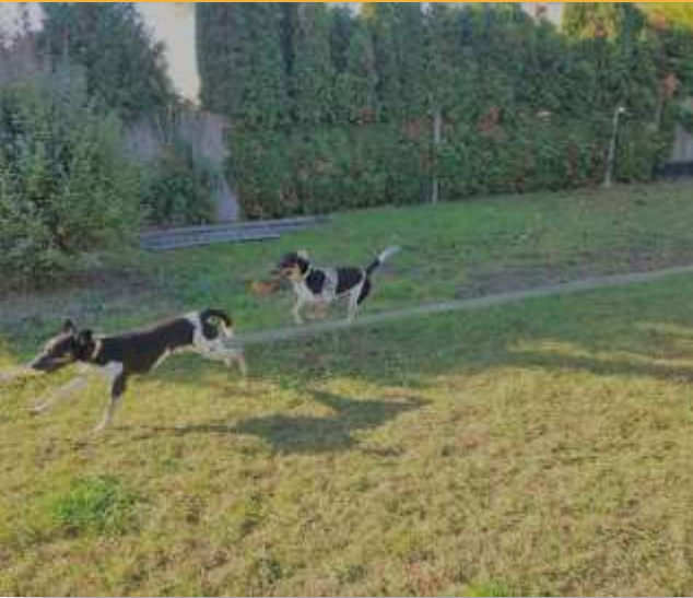
Aporting zones and Dog park area